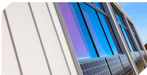
Northumberland College - STEM Facility