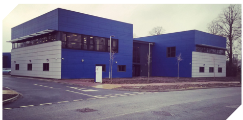
Durham County Council - Netpark