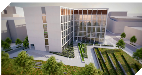
Newcastle City Council - Laboratory