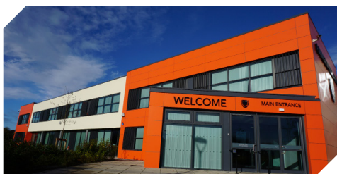
Ashington Learning Partnership - Ashington High School