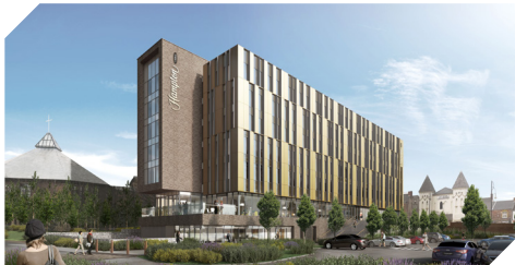
Stockton Borough Council - Northshore Hotel

"Aura has supported Northumberland College on their most recent development of the STEM Facility through the NEPO Framework. We found the NEPO Framework to be very accessible and a quick and easy procurement method. Aura were accommodating and approachable which coincided with our needs. Aura were able to utilise the services of Summers Inman to work on the STEM facility. The facility was delivered on time and in line with our brief. We very much look forward to using the NEPO framework and working with Aura in the future".